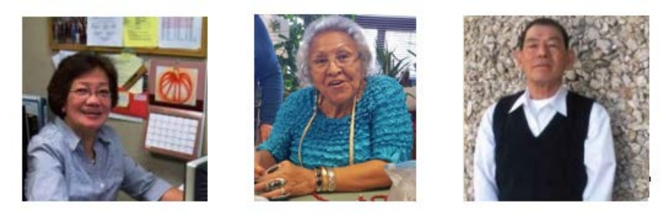
For stories from Diverse Elders Coalition SCSEP participants, visit <u>http://bit.ly/SCSEPStories</u>

SCSEP is the only federally-funded program specifically targeting older adults seeking employment and training assistance. The goal of SCSEP is to help participants gain work experience and overcome barriers by receiving on-the-job training at not-for-profit, 501(c)3 community-based organizations or government agencies.